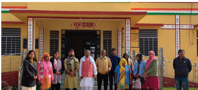
VGU volunteers visited the adopted villages Barala and Rampura Bas under the Unnat Bharat Abhiyaan (UBA) Scheme. Engaging in a Gram Sabha there, they met with members of Panchayat Samiti, Schools, Aanganwadi, Asha Sahiyogini, and PHC, as well as the youth, elderly, women, and children.