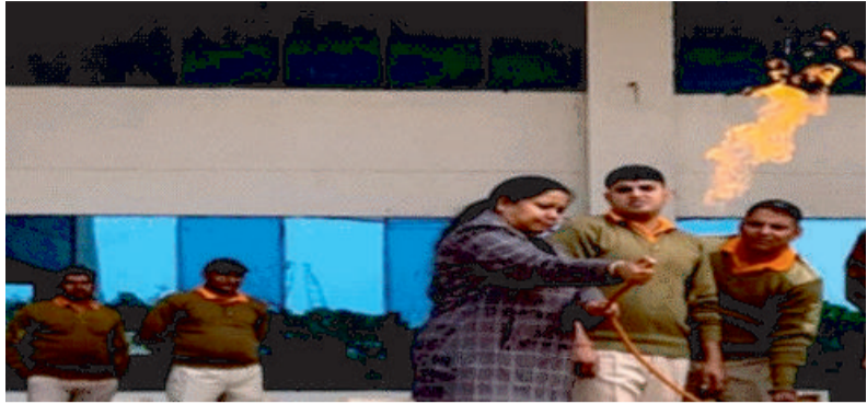
From first aid to disaster response: From first aid to disaster response, the SDRF workshop empowered us to be safety guardians. Inspired and ready to make a difference.