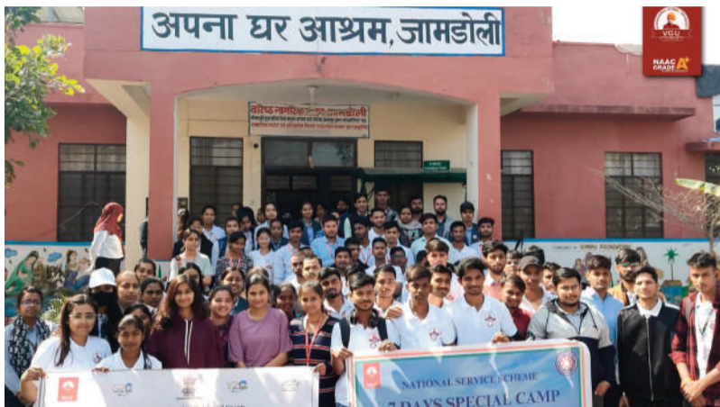
7 days, countless stories of impact. We cleaned, we connected, we cared. From 'Cleanliness Drive' to 'Apna Ghar Aashram' visit, culminating in a day of free Medical Checkups, our NSS journey radiates empowerment. Today, we close this chapter with gratitude and a commitment to making change happen.