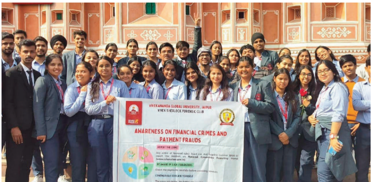
Fight against financial crimes: VGU students are campaigning to fight against financial crimes. Their survey on awareness is a step towards a safer, more informed community.

If we unite, we have the potential to create a network that spans the entire country and various professions. Your active participation will contribute to the continued success and growth of our alma mater." He further highlighted, "Today, we have 16,700 alumni in the VGU Alumni Association.