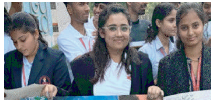
Empowering Barala Village with a 7-Day Special Camp! In camp various events were organized including a poster competition in which showed their creativity.