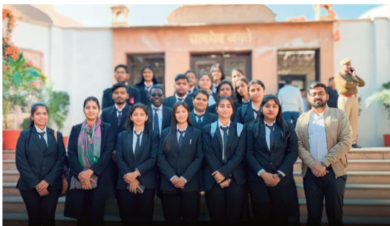
Exploring the realms of justice: VGU's Law students visited the High Court to immerse themselves in the intricacies of civil and criminal procedures during a visit to the Hon'ble Rajasthan High Court (Jaipur Bench) on February 8, 2024.